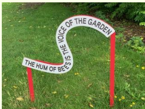
A sign in London's Kew Gardens

Plant so your own heart will grow ~ Hafiz ~